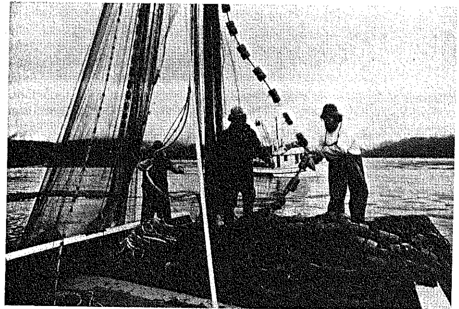
Captains and crews take considerable pride in how fast they can retrieve their seine. This is one of several fisherman's skills that could be turned into a spectator event, but no one has done so.

An anthropologist looking at the whole day's celebration would classify it as a rite of solidarity. Parades and public fireworks are part of Independence Day all across the United States. Their function is to build community pride as well as strengthen national identity. Logging contests, however, have a very limited geographical distribution, and their inclusion in Ketchikan's Fourth of July festivities focuses attention on and celebrates the region's distinctive cultural heritage. As a result, visitors and residents alike feel they have witnessed something special, something peculiarly Alaskan.